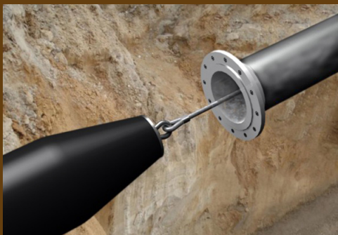
Oversized HDPE liner insertion

Step 5. The HDPE liner is pulled through a roller reduction box prior to entering the steel host pipe. The radial compression of the HDPE liner allows it to temporarily fit within the inner diameter of the steel pipe. This reduction in the HDPE liner's outer diameter is maintained due to axial tension during the pulling process.