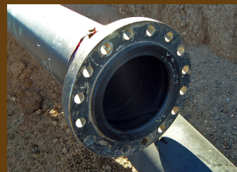
HDPE Lined Section

Step 8. The lined segment is thoroughly tested prior to bolting up the steel flanges at which point the pipeline is ready to be placed back in service.